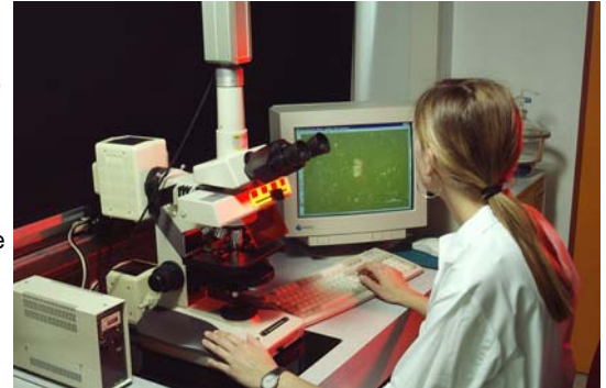
Microbiological examination under the Epifluorescence microscope